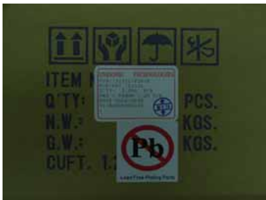
外箱原格式(加貼無鉛標示) Original(Sole Pb-free label)