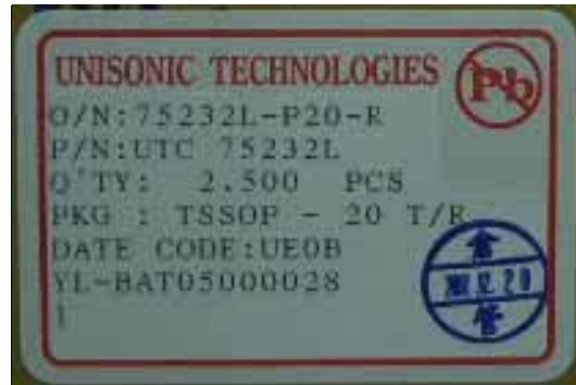
標籤新格式(加印無鉛標示) New(label with Pb-free)