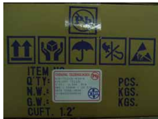
外箱新格式(無鉛標示印在外箱上) New(Pb-free mark in carton)