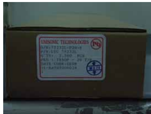
內盒新格式(無鉛標示印在標籤上) New(Pb-free mark in label)