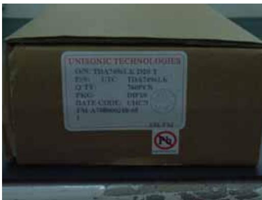
內盒原格式(加貼無鉛標示) Original(sole Pb-free label)